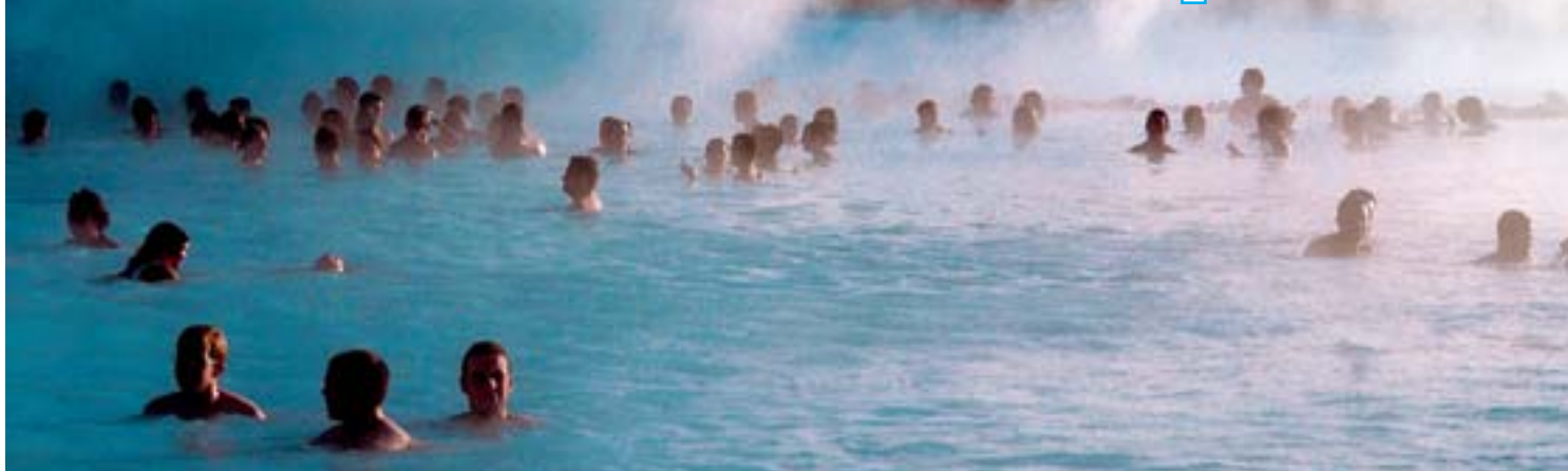
Revelers enjoy the geothermal baths at an Airwaves Blue Lagoon party during the Iceland Airwaves Music Festival in Reykjavik.