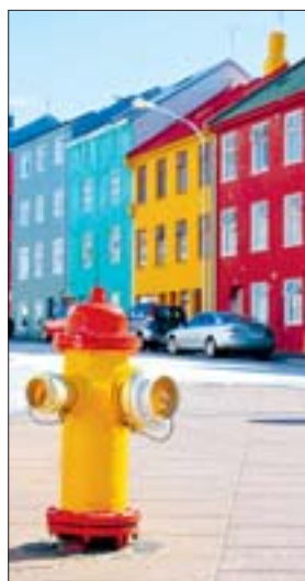
Reykjavik has colorful architecture and nightlife.

Bonus: The flight is just five hours from New York.