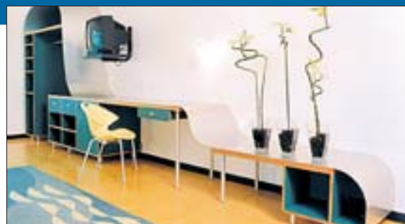
The Greenporter can serve as a base for exploring Long Island's organic farms and vineyards.